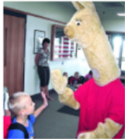
A costumed llama will be present!

Remember to bring your camera and your llama books for photo opportunities and book signings!